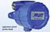
optional panel probe-head