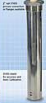
2" stainless steel probe connected to T-type interface

Over 40 years of ARJAY's field-proven oil separator monitoring has been applied to the 4100-DWS level monitor. The unique oil/water probe provides complete flexibility for monitoring oil/water separators in one, two-phase and two.