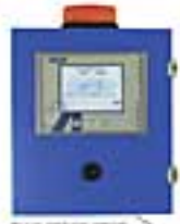
Shut-off panel (shown optional)

The 4100-DWS sensing probe monitors the separation level between the grease and the aqueous phase, as the oil accumulates and displaces the water. The probe separates changes. This response allows us to provide complete, instant and long control.