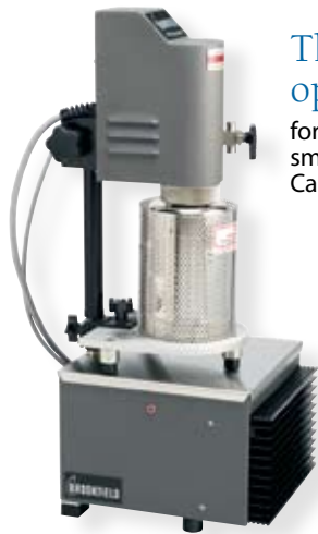
Thermo Bath option for sample heating with small space requirement. Call for details.