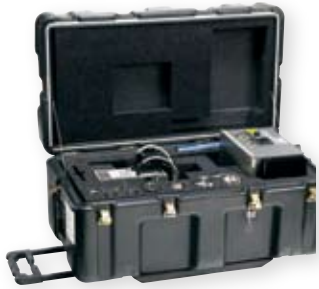
Carrying Case for portability in the field

Fracturing Fluids Drilling Muds Volatile Chemicals Petroleum Products Black Liquor